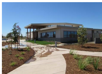
Colusa County Campus