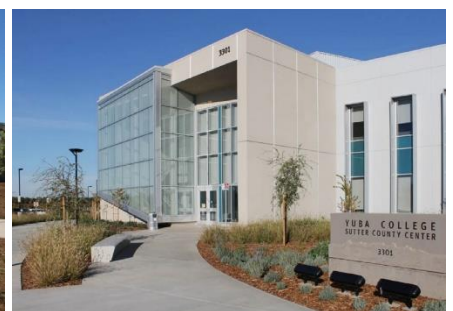
Yuba Campus-Sutter Center