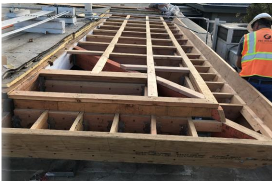
Yuba College Building 600 Structural Roof Repairs Project