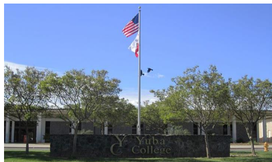
Yuba Community College