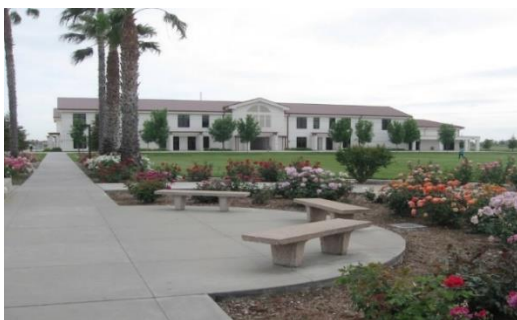
Woodland Community College

As required by Education Code Section 15278, the Districts' Board established a Citizens' Bond Oversight Committee composed of community leaders with expertise in finance, accounting, education, construction, sustainability and local government. The committee is charged with the responsibility to assure voters that bond proceeds are expended only for construction, reconstruction, rehabilitation or replacement of College facilities in compliance with the ballot language approved by voters, and that no funds are used for teachers or administrator salaries or operating expenses.