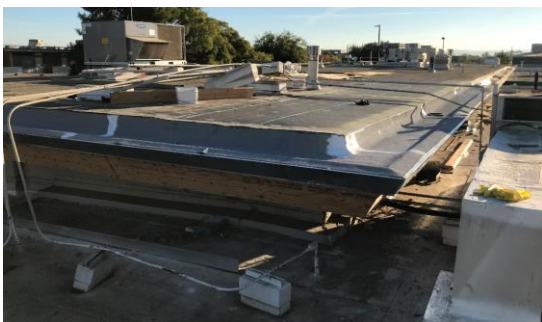
Yuba College Building 600 Structural Roof Repairs Project