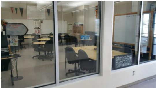
Woodland Community College, Building 800 Corridor Improvement Project