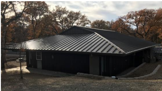
Lake County Campus, Building 400 Roof and Retaining Wall Replacement Project