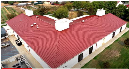
Woodland Community College, Building 600 Replacement Project